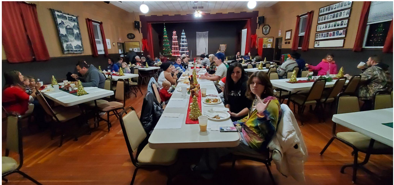
Guests enjoying dinner at the Beavercreek Grange's annual community potluck on Dec. 3.

Local Food Pantry. Beavercreek United Church of Christ, 23345 S Beavercreek Rd. By appointment only. Call (503) 593-2338. A volunteer will ask what you would like and make a box, following social distancing. Please call to schedule an appointment. Daily from 8:00 AM to 5:00 PM.