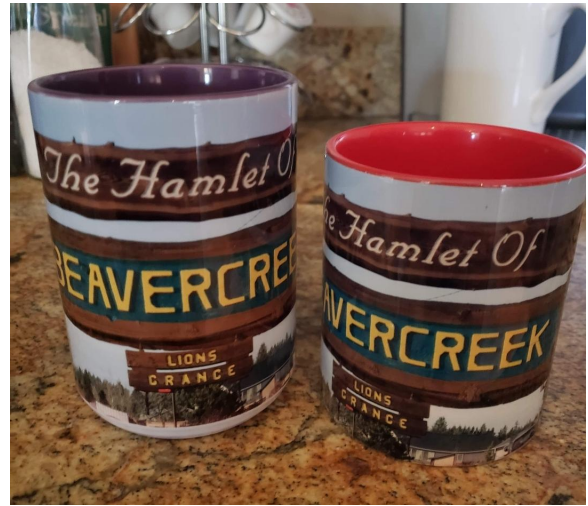
Beavercreek mugs for sale by Carla Vail.

meetings via Zoom online conference at 7:00 p.m. the fourth Wednesday of each month (except for December). The conference link is published on the Hamlet website each month at beavercreek.org/blog/ .