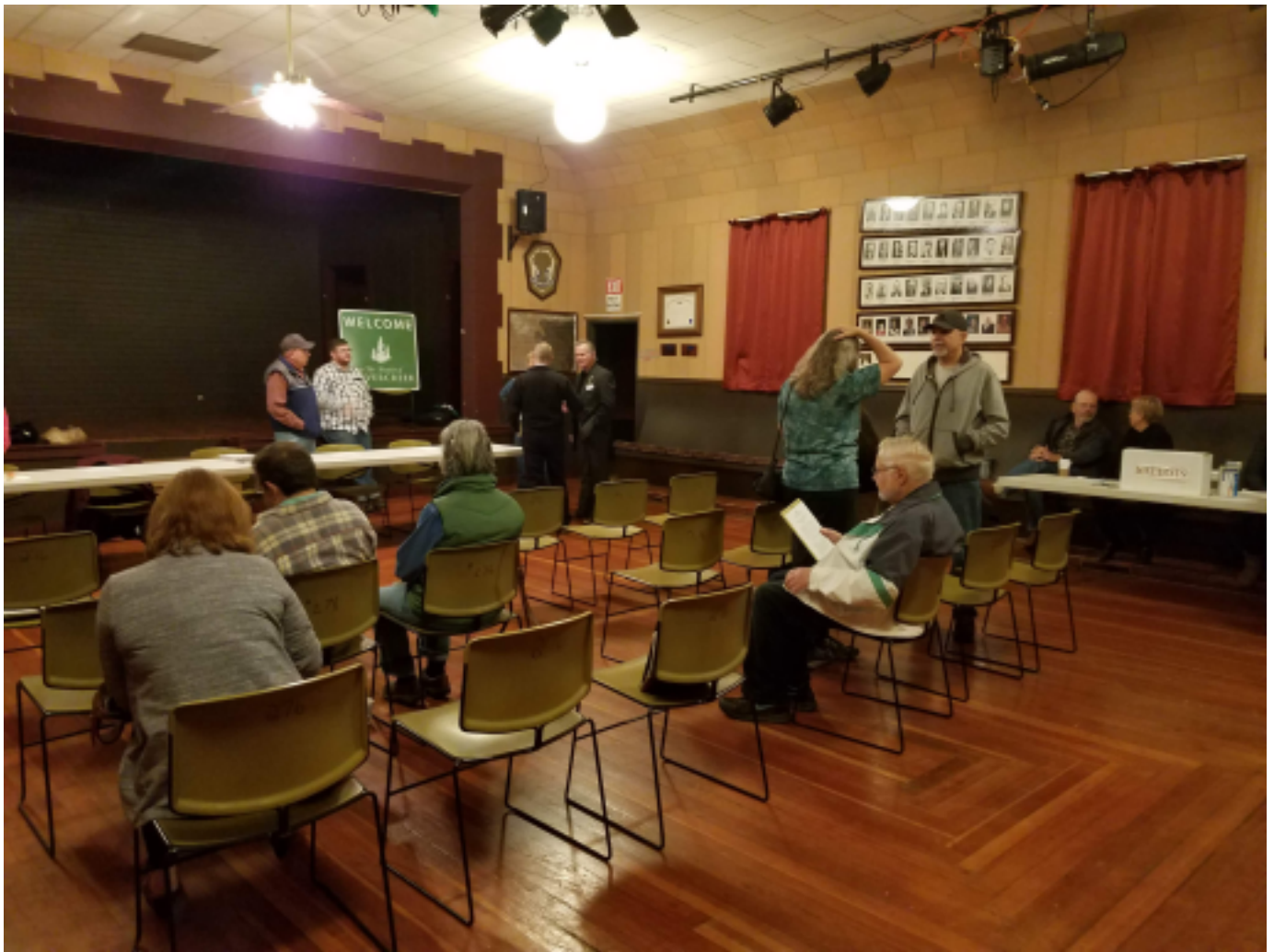
Voting at the October Town Hall meeting.