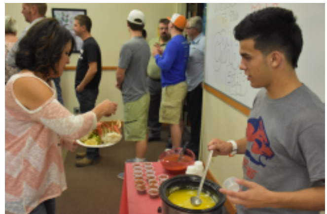
CCC Wrestling Crab Feed.

The Clackamas County 4-H Tack Sale is a fundraiser for the 4-H Horse Advisory Committee. It is held twice each year at the Clackamas County Fair and Event Center in Canby, on the third Saturday of March and October. The sale includes new and used tack as well as other horse-related items. Parking 5$, admission is $1 per person.