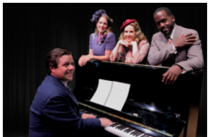
The Melody Lingers On.

Performances take place Thursday-Saturday at 7:30pm with 2:30pm Sunday matinees. Clackamas Rep will celebrate opening night with a champagne and dessert reception in the lobby following the Aug. 5 performance. The Aug. 10, 17 and 24 performances will include interactive post-show talkback sessions with the cast and director. Tickets may be purchased at www.ClackamasRep.org or by calling 503-594-6047.