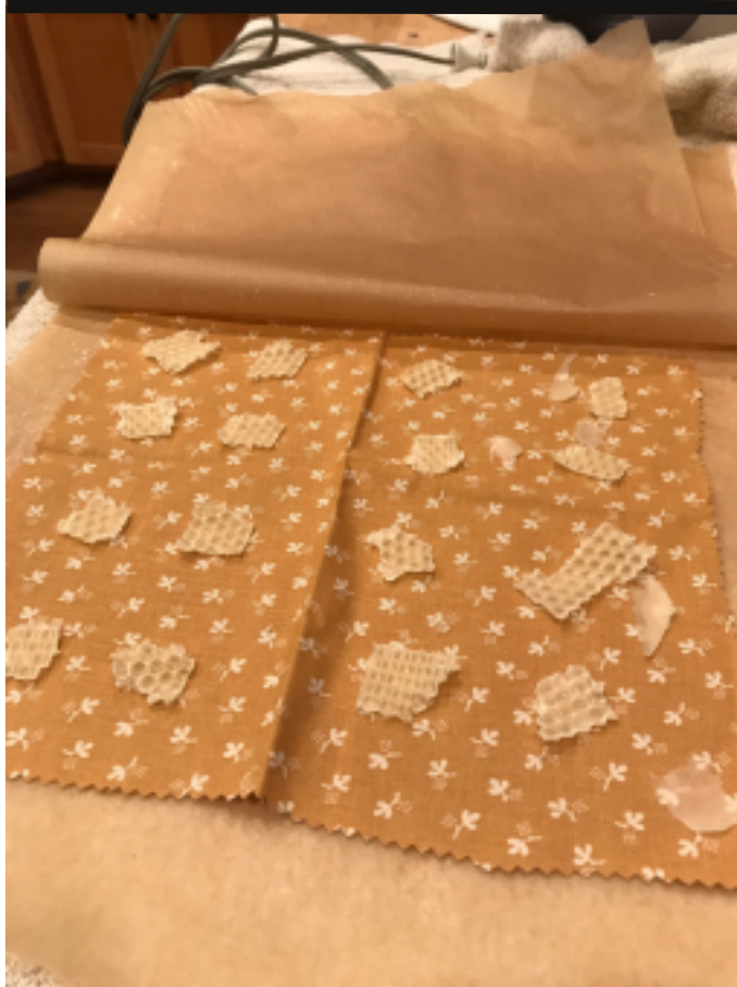
Cutting fabric, shredding beeswax, and preparing for ironing beeswax wraps.