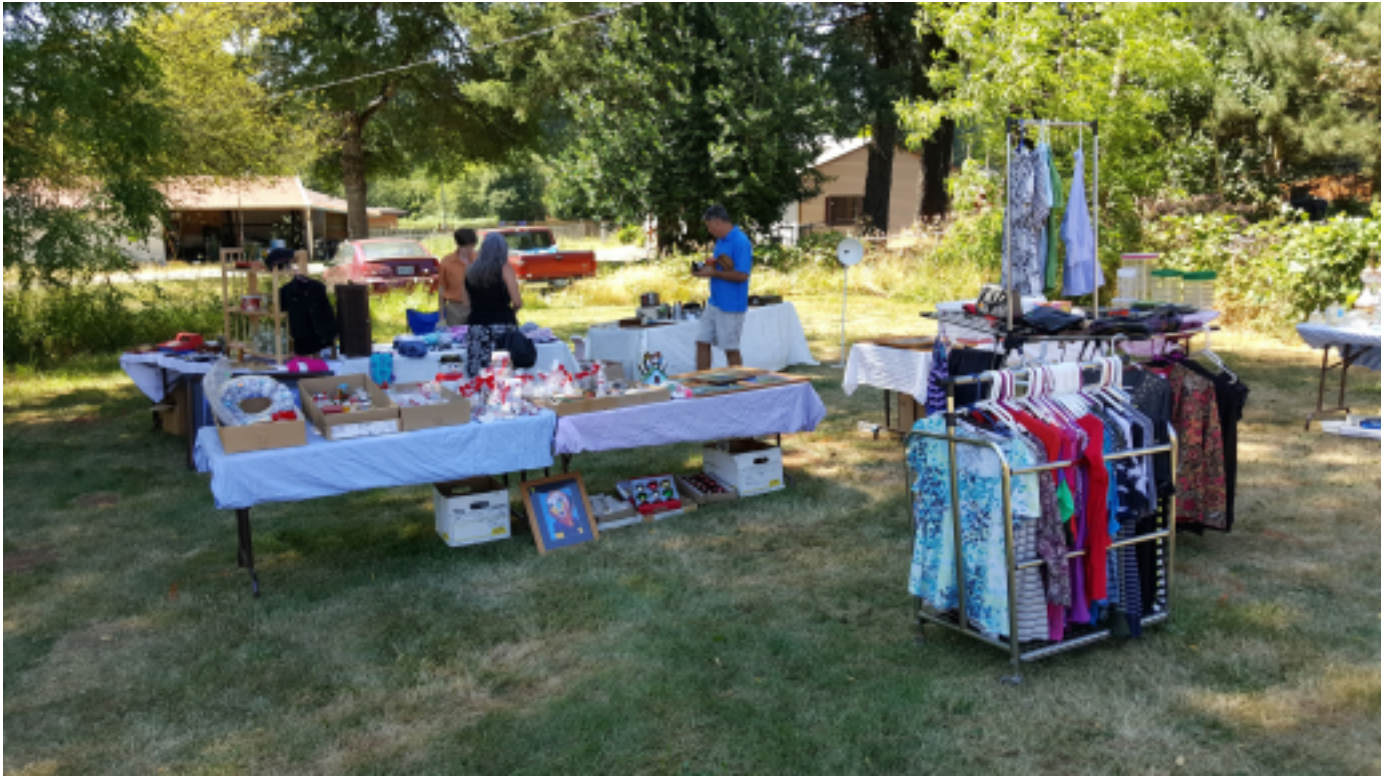
A vendor in the shade at the 2017 Beavercreek Flea Market & Craft Sale.

To ensure this event happens next year, the Hamlet is seeking a committee chair to run it. One must be found by January 2018 or the event may not continue. Like every event hosted by the Hamlet of Beavercreek, there is historical documentation, an event timeline, supplies, a few volunteers to assist, and guidance from a Hamlet board member for the new chair. If you know of someone who is interested, please have them contact bcflea@beavercreek.org . We hope someone will step up to ensure this fun local event can continue.