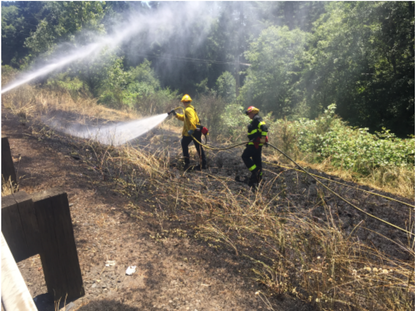
Clackamas fire fighters putting out the Highway 213 brush fire.