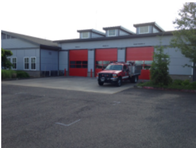
New red doors on the Beavercreek Fire Station

The Beavercreek Station also got a new paint job, and will soon receive new and repaired asphalt as well as asphalt seal (as will the Clarkes Station). In addition, 11 Fire District properties underwent a conversion to LED lighting, both interior and exterior. Not only does this conversion improve lighting at these facilities, it should also help to reduce energy costs. The Facility Maintenance Department contracted with the Energy Trust of Oregon to complete this project. While the entire package cost was in excess of $135,000, the Fire District's portion was approximately $5,500, or about 3.9% of the total cost.