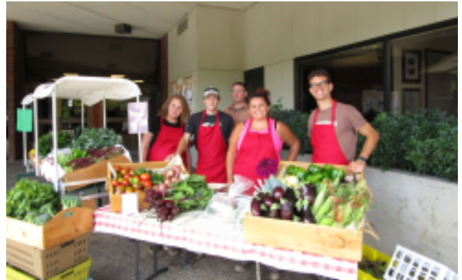
Student Farmer's Market.

The Clackamas County Fair has been around for over 100 years, and celebrated its centennial birthday in 2006. Save the date for five days of PRCA rodeo action with the Canby Rodeo, Funtastic carnival rides, food, and midway entertainment. Interested in volunteering, exhibiting, purchasing tickets, and more visit www.clackamas.us/fair/fair.html .